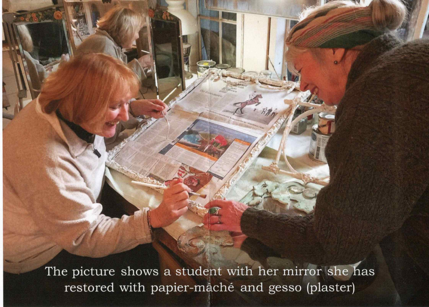
The picture shows a student with her mirror she has restored with papier-mâché and gesso (plaster)